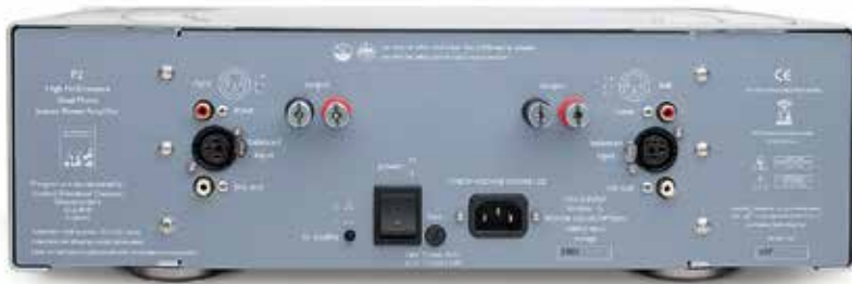
ABOVE: Single-ended (RCA) and balanced (XLR) inputs are joined by single-ended loop-through outputs and a single set of unswitched 4mm speaker binding posts

the amp simply presented the track in a way that really made me want to sit and listen intently.